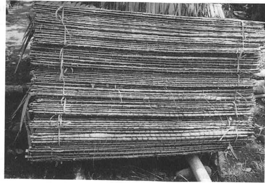
Photo. 4 Thatch roofing material made of sago ready for market in Babah, Talacogon, Agusan Del Sur, Philippines.

It was observed that there are only two species growing in the area. They were almost thornless type and very few thorn type. The thornless type was morphologically identified as Metroxylon sago Rottb. and the thorn type was Metroxylon sago rumphii Mart. All growth stages can be seen in various individual farms. The oldest palm is estimated to be about 12 years old, counted the number of scars on the trunks and calculating with a rate of twelve leaves of sago palm development per year. However, there are few mature palms in these areas. The average age of a sago cluster or forest is estimated to be between four and five years old.