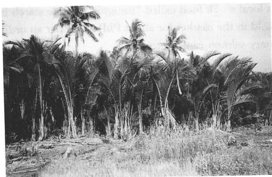
Photo. 1 Clusters of sago in El Salvador, Misamis Oriental, Mindanao, Philippines.

growth (Fig. 1) is in the marshlands of Agusan Del Sur and partly Agusan Del Norte, Northern part of Mindanao. Specially, the Municipality of Pros-