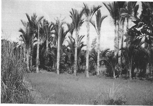
Photo. 3 Clusters of sago in the paddy field, Babah, Talacogon, Agusan Del Sur, Philippines.