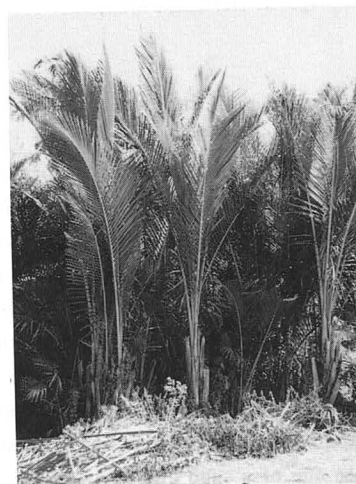
Photo. 2 Sago forest in Alubijid, Misamis Oriental, Mindanao, Philippines.

growth (Fig. 1) is in the marshlands of Agusan Del Sur and partly Agusan Del Norte, Northern part of Mindanao. Specially, the Municipality of Pros-